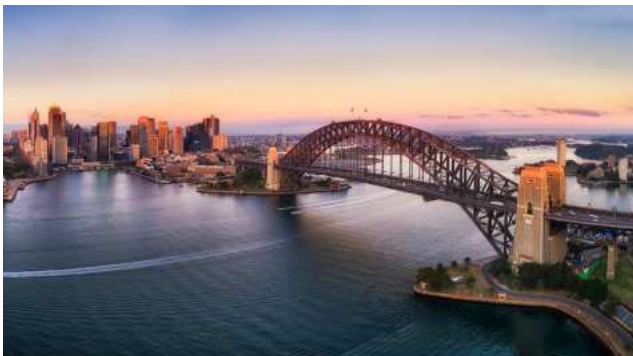
The 2012 choice: mediocre Sydney ...

The Darwin market is booming. The market in Sydney is not (and has been subdued for many years). What does the investor do? Her decision will impact on her financial future.