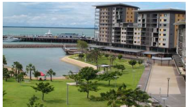
.... or booming Darwin